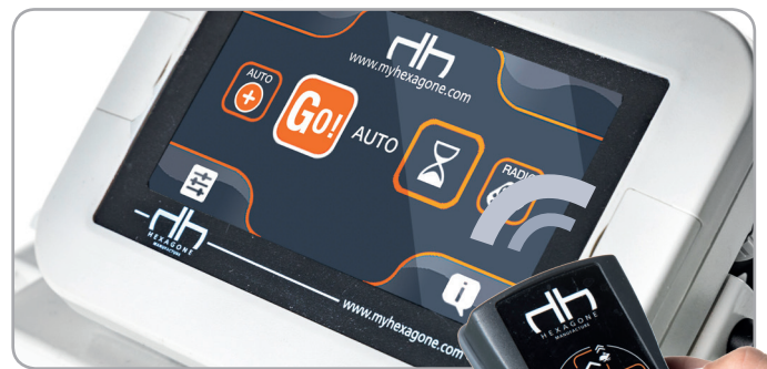
Color Touch Screen